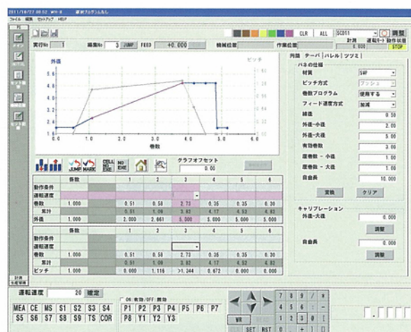
Pitch line chart on program screen

Having adjustment mechanisms for Rotational direction along with Coiling pin in/out, Bobbing and Tilting movement.